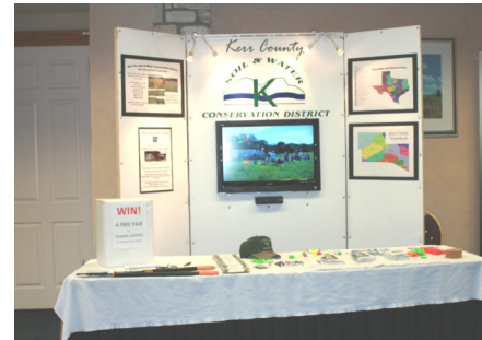
The District's newly constructed promotional booth made it's debut at the TSGRA meeting.

Goodies from the SWCD, as well as from TSSWCB were given away. A slide show of recent pictures of the SWCD's activities were shown