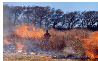
A prescribed burn is an effective tool in rangeland conservation and management.

members in the successful use of fire. The chapter maintains equipment that is available to members for their use. The chapter is open to anyone interested in ecological restoration or the prevention of wildfires. For meeting information contact Al Wilson (830-238-7164; abwtoty@hctc.net).