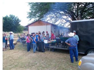
The Kerr SWCD cooked lunch for all the students and instructors at the Kerr WMA.

Each June, a group of 14-18 year olds participate in the Texas Youth Range Workshop, which is headquartered at the Texas Tech University campus in Junction. This year over 50 kids participated, many of them sponsored by conservation groups or individuals. In this camp the attendees are exposed to actual land management practices and go on field trips to private ranches and the Kerr WMA. The Kerr Co. SWCD provides lunch each