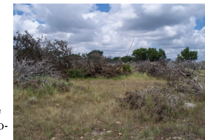
Brush management of Ashe Juniper is one of the main resource concerns addressed by NRCS's EQIP and WHIP programs.

NRCS has additional programs that aid in the conservation of natural resources. Another program available in Kerr county is the Wildlife Habitat Incentive Program. This program is designed for land-owners who focus more on wildlife management than agriculture and most of the practices involved are the same as EQIP's. The Grassland Reserve Program is a program to improve grazing management and protect rangeland from development with either rental or easement options. The Conservation Stewardship Program is a program that provides incentives to producers that have implemented con-