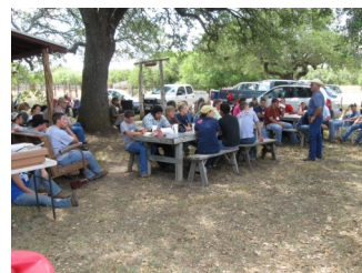
Students at the camp listened to the presentation given at the Kerr WMA.

camp covers include range-land ecology, plant identification and collecting, watershed management, stocking rate evaluation, total ranch planning, tools of range and natural resource management and restoration and the impacts of management decisions. The kids get a lot of hands-on training on these topics and leave with a better sense of what the definition of land stewardship means. For more information on this camp, please see their website at: www.rangelands.org/texas/youtheducation.htm .